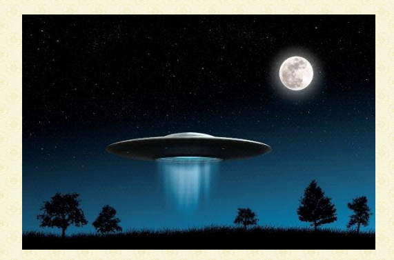
This is what is used today: