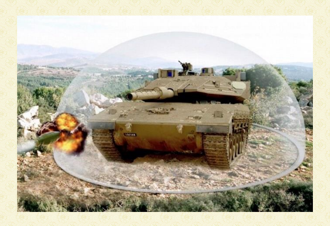
System on a US M1A2 Abrams: